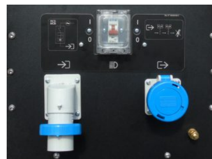
Standard control panel

The new frame of the Linktower T3 is designed to better protect the control panel from rain.